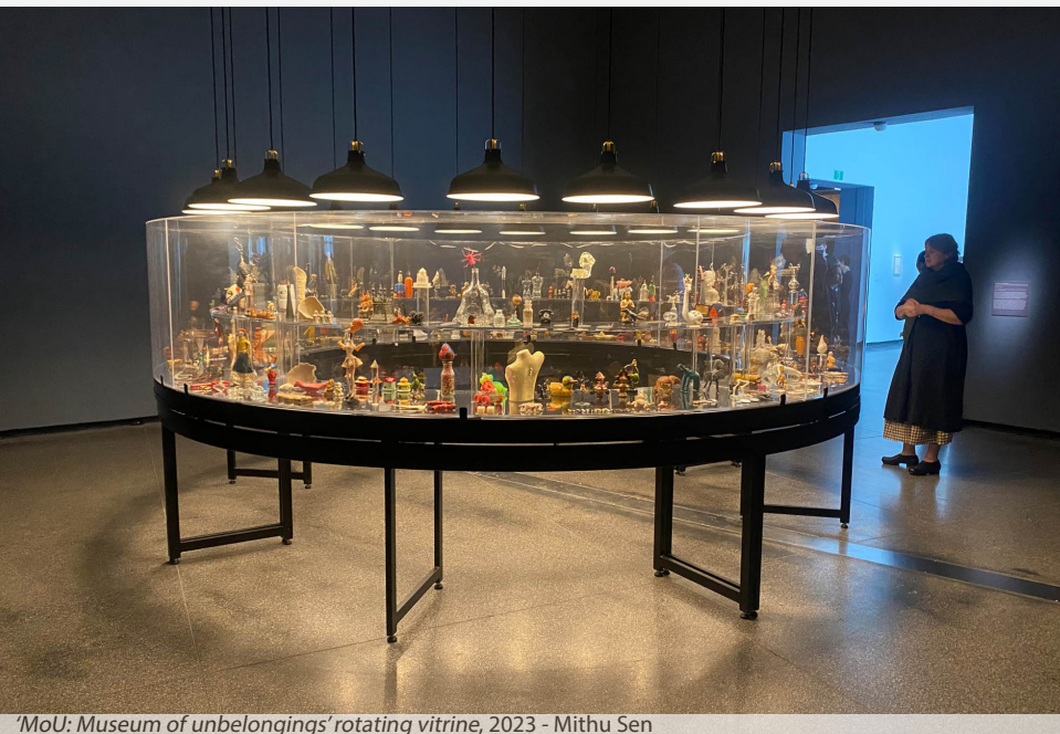
'MoU: Museum of unbelongings' rotating vitrine, 2023 - Mithu Sen