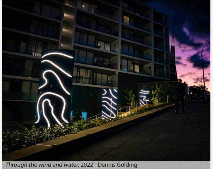
Through the wind and water, 2022 - Dennis Golding