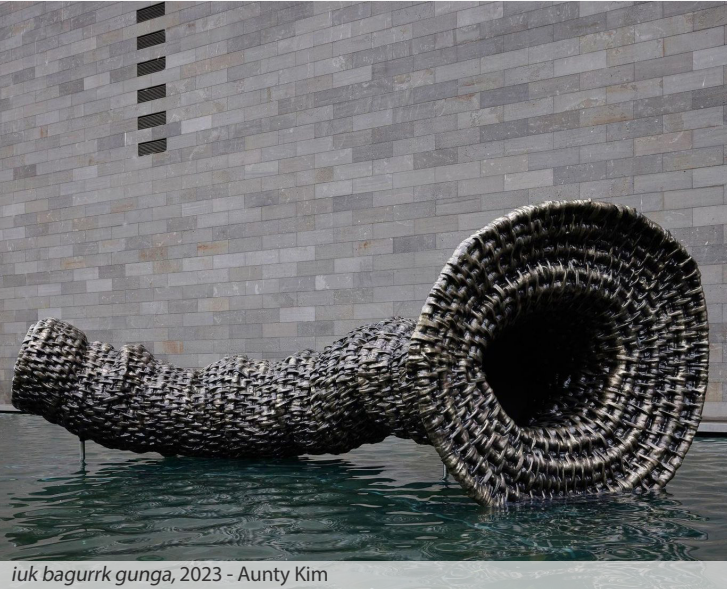
iuk bagurk gunga, 2023 - Aunty Kim

A team of skilled creatives that love to problem solve.